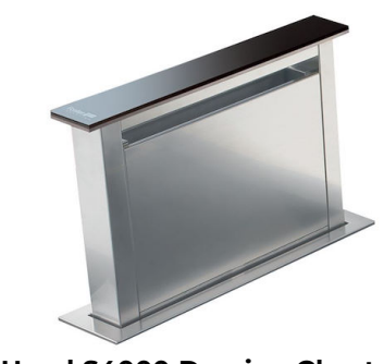
Hood S4000 Domino Ghost 2451 000