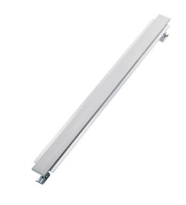
Spacer for Domino elements 8320 000